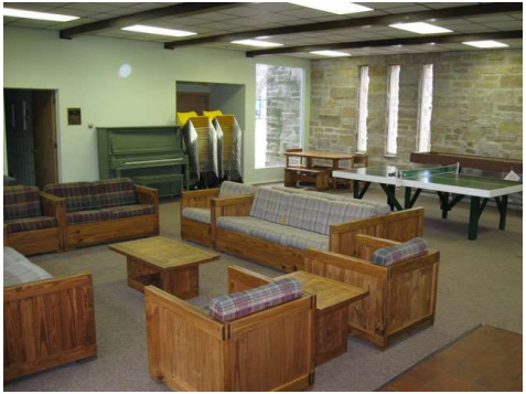
Robins South Cabin